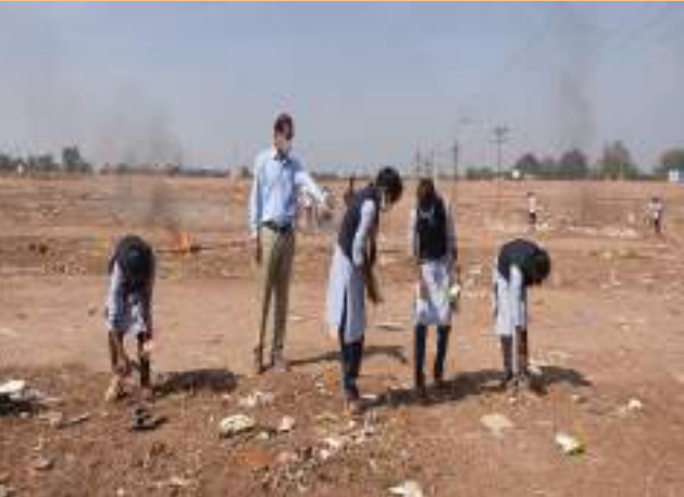
The Volunteer Cleaning and Plastic Collection of Yallamadevi temple area