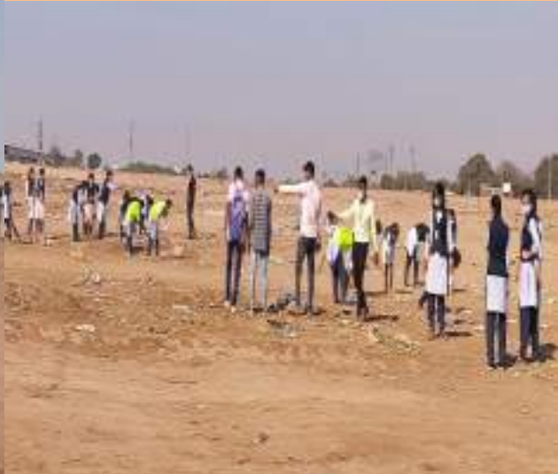
the Volunteer Cleaning the Left Site Area in Yallamadevi Religious Place