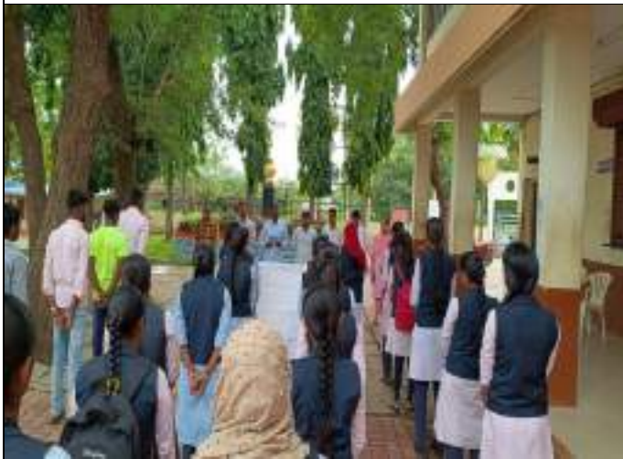
NSS Voluntaries present for the campaign "Ek Tarikh Ek Taas"