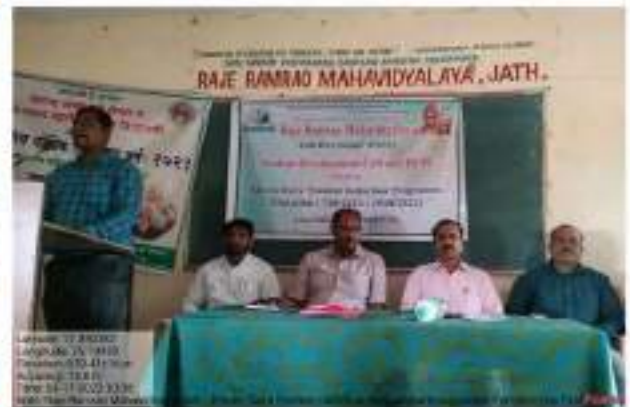
Some geo tagged photos of the function