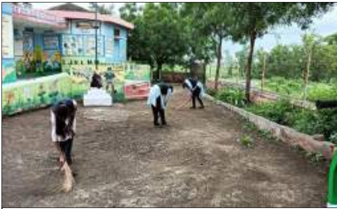
Cleaning at Indiranagar Primary School done by NSS Volunteers