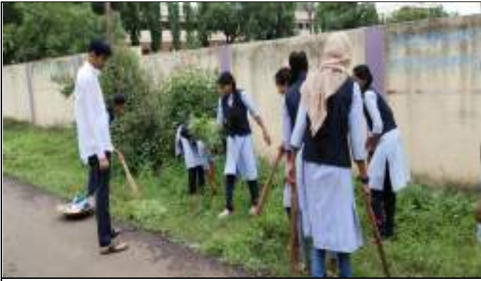
Cleaning at College Premises is done by NSS Volunteers