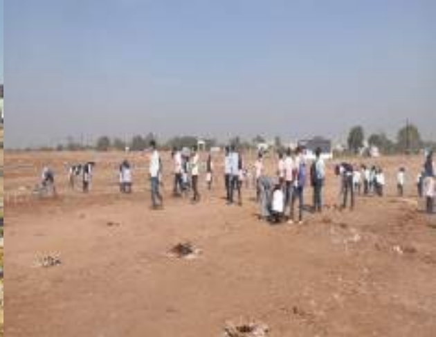
the Volunteer Cleaning the Right Site Area in Yallamadevi Religious Place