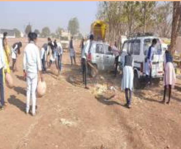
The Volunteer Cleaning and Plastic Collection of Chhatribag area