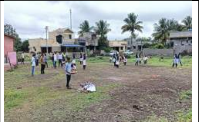
Cleaning at Sunetra Colony was done by NSS Volunteers