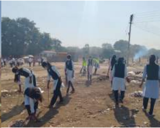
the Volunteer Cleaning the front Site Area in Yallamadevi Religious Place