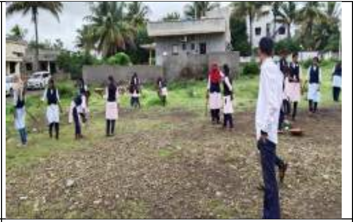
Cleaning at Sunetra Colony was done by NSS Volunteers