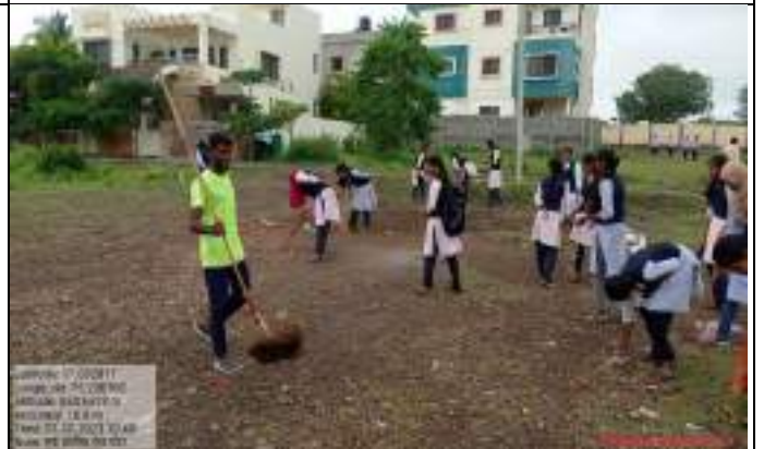
Cleaning at Sunetra Colony was done by NSS Volunteers