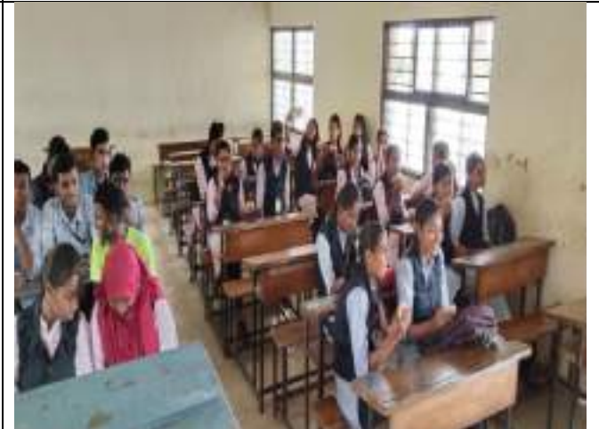
Refreshments were given to NSS Volunteers after the completion of the campaign "Ek Tarikh Ek Taas"