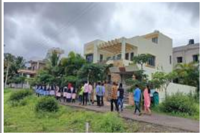
NSS Volunteers with Teachers participated in the campaign "Ek Tarikh Ek Taas"