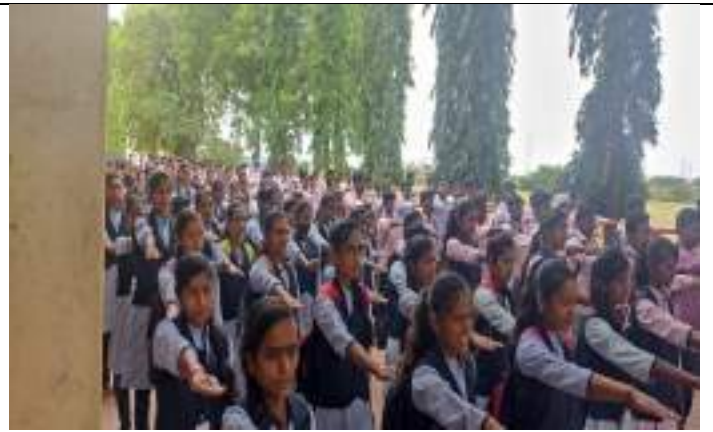
'Panch Pran' Done by Students