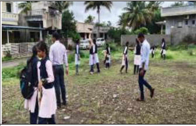
Cleaning at Sunetra Colony was done by NSS Volunteers