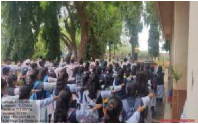
'Panch Pran' Done by Students