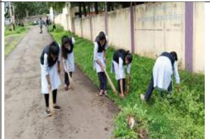
Cleaning at College Premises is done by NSS Volunteers