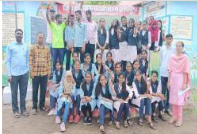
Group photo of NSS Volunteers with Teachers