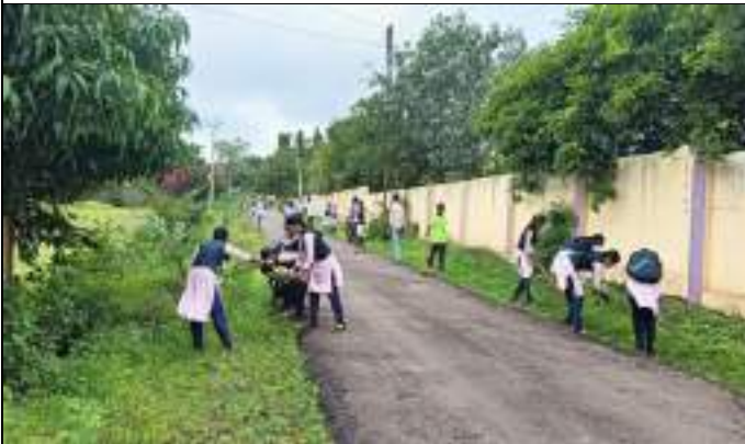
Cleaning at College Premises is done by NSS Volunteers