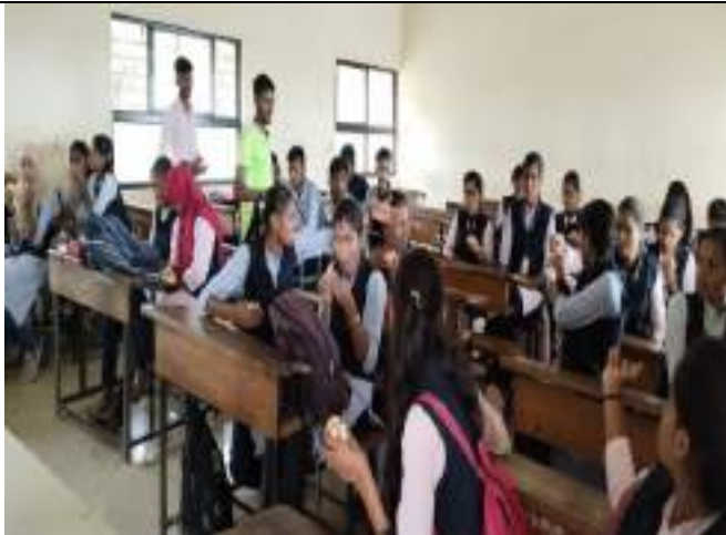
Refreshments were given to NSS Volunteers after the completion of the campaign "Ek Tarikh Ek Taas"