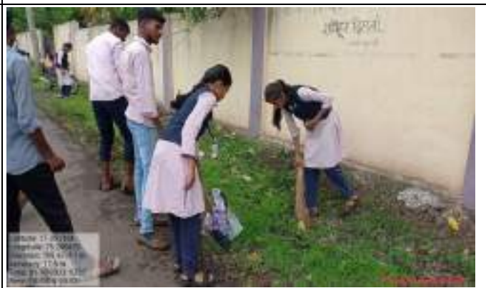
Cleaning at College Premises is done by NSS Volunteers