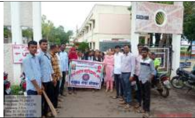
Inauguration of the campaign “Ek Tarikh Ek Taas” by NSS committee members & NSS Volunteers