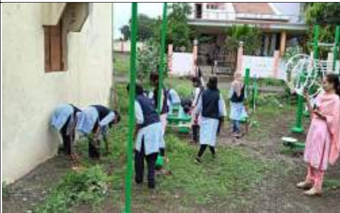
Cleaning at Indiranagar Primary School done by NSS Volunteers