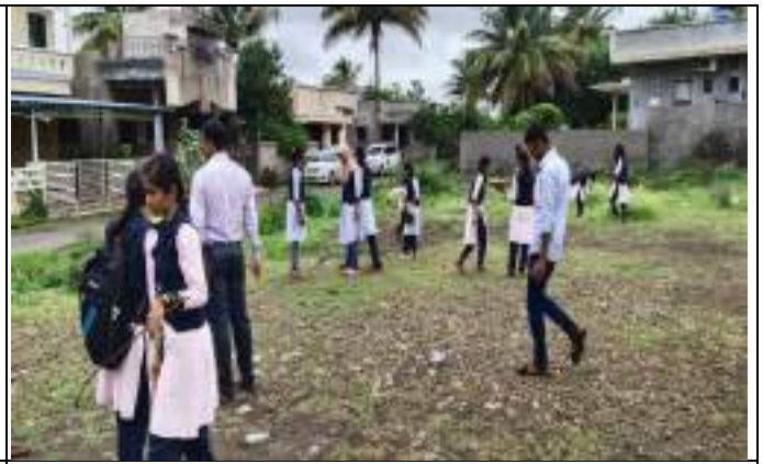
Cleaning at Indiranagar Primary School done by NSS Volunteers