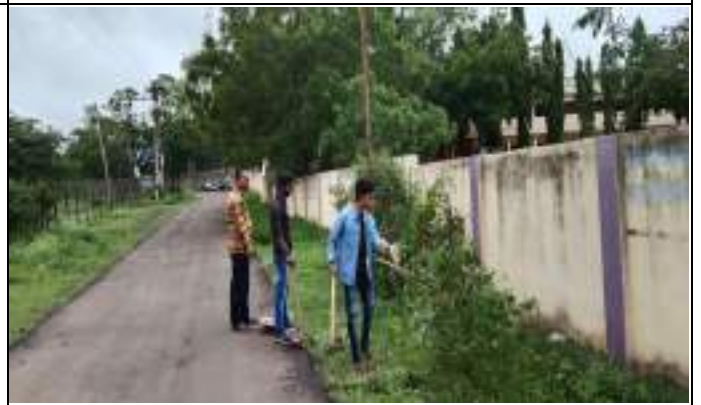
Cleaning at College Premises is done by NSS Volunteers