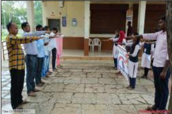
'Oath of cleanliness' done by NSS Voluntaries & NSS committee members