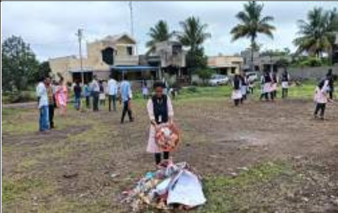
Cleaning at Sunetra Colony was done by NSS Volunteers