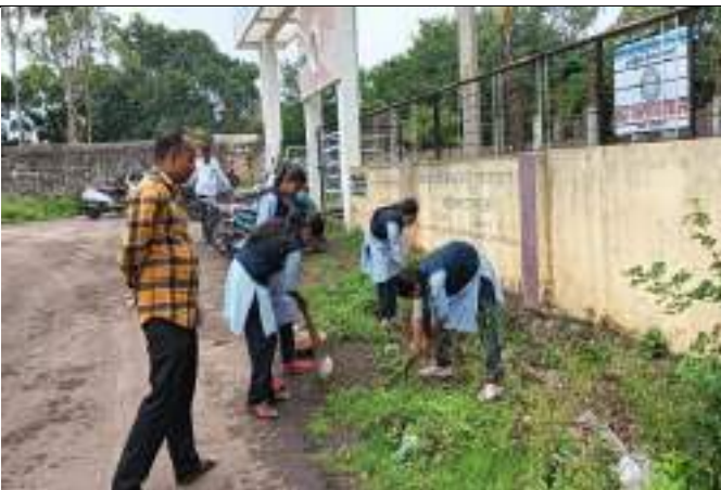
Cleaning at College Premises done by NSS Volunteers