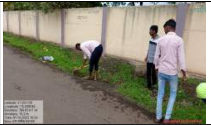
Cleaning at College Premises is done by NSS Volunteers