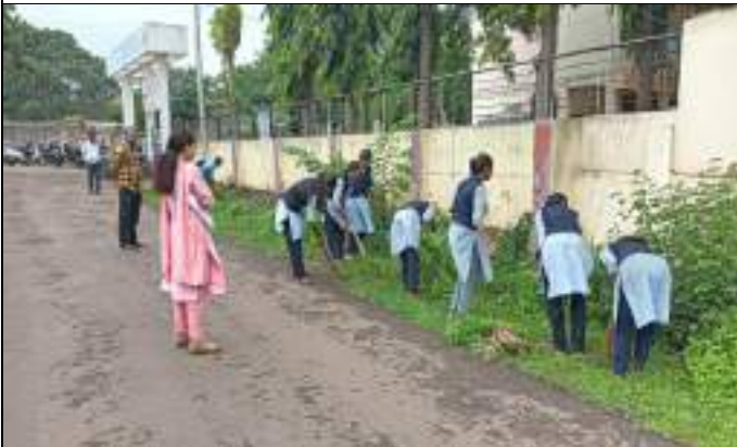
Cleaning at College Premises is done by NSS Volunteers