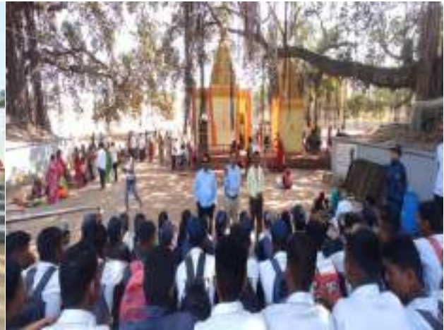
Group Snapshots in the Allamadevi Temple, Jath