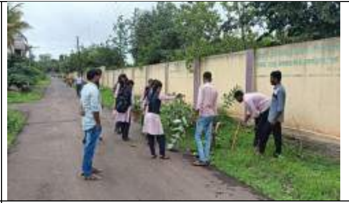
Cleaning at College Premises is done by NSS Volunteers