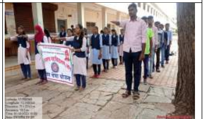
'Oath of cleanliness' done by NSS Voluntaries