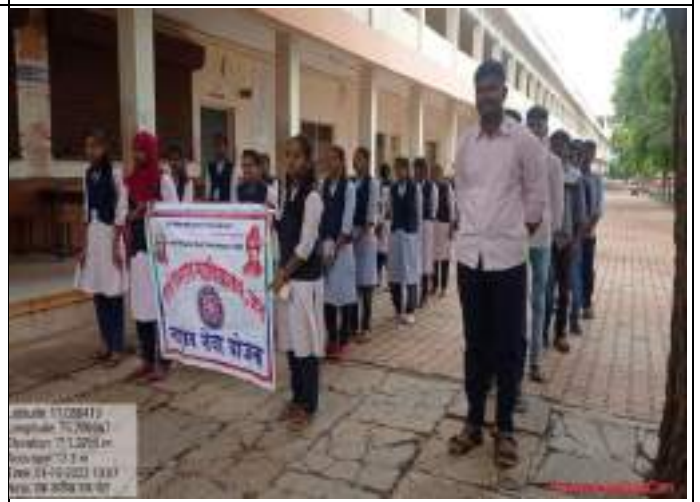
NSS Voluntaries present for the campaign "Ek Tarikh Ek Taas"