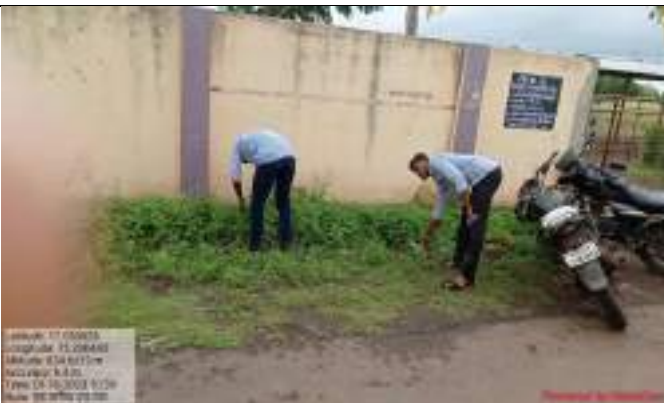
Cleaning at College Premises is done by NSS Volunteers