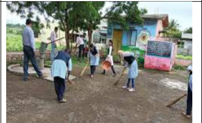
Cleaning at Indiranagar Primary School done by NSS Volunteers