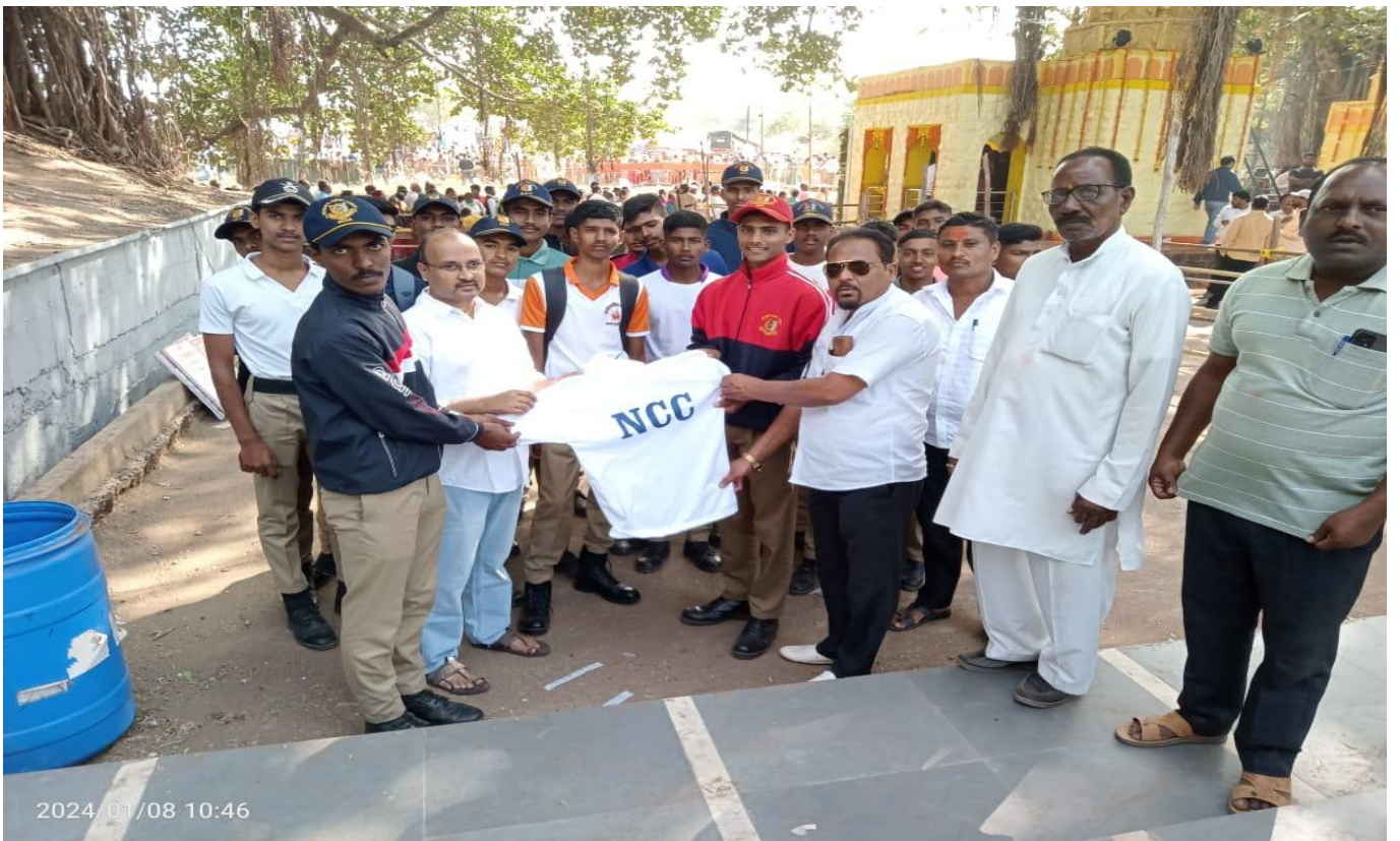
VOLUNTEER NCC CADETS WITH ROYAL FAMILY OF JATH