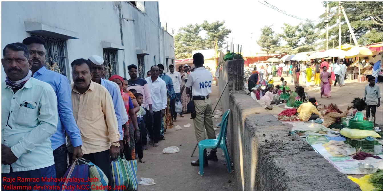
Raje Ramrao Mahavidyalaya, Jath Yallamma devi Yatra Duty NCC Cadets, Jath