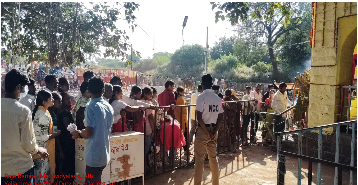
Raje Ramrao Mahavidyalaya, Jath Yallamma devi Yatra Duty NCC Cadets, Jath