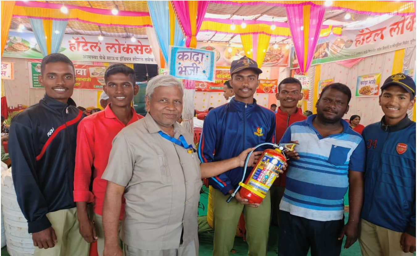
DEVELOP AWARENESS ABOUT FIRE EXTINGUISHER